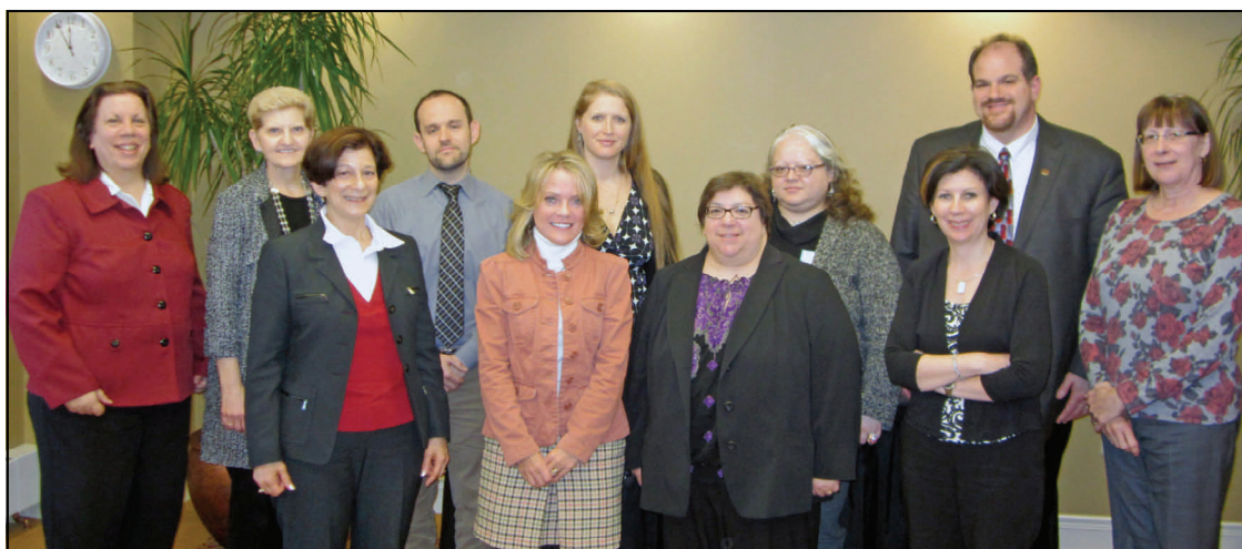
MAR Special Advisory Group: Resource and Academic Libraries

Participants in this first round of meetings were very enthusiastic, and gave the NN/LM MAR staff useful feedback and recommendations for the next contract year. Future quarterly committee meetings will be conducted virtually. Minutes from each of these meetings will be posted on the NN/LM MAR Web site ( http://nnlm.gov/mar/about/sag.html ).